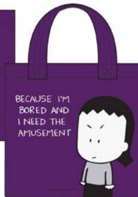
7604-FA - BACK