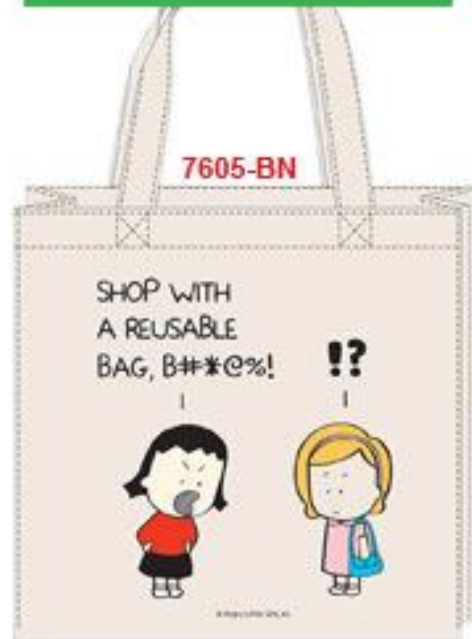
Reusable Bag Bitch! Tote