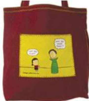
50407-WM "I GOT YOU A GIFT." "WHY YOU WASTE MONEY!!!"