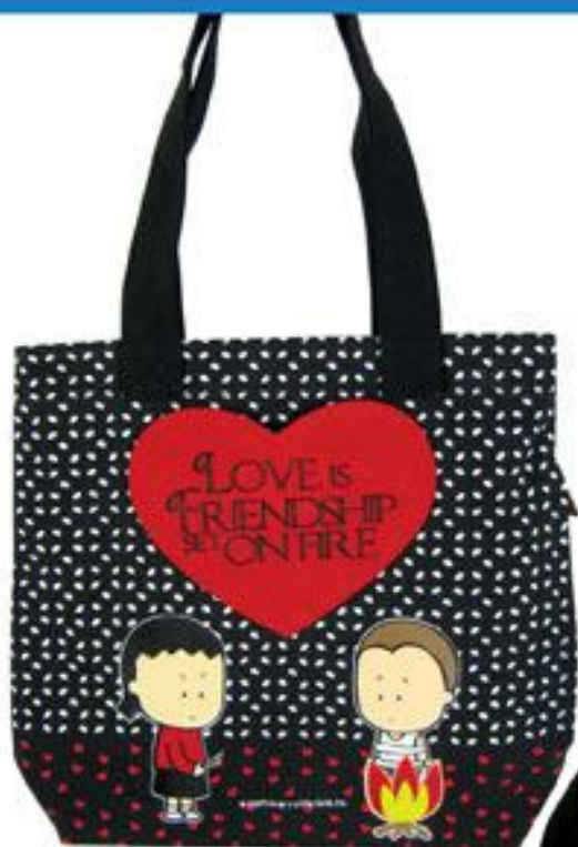
7702-LF "Love is Friendship Set on Fire"