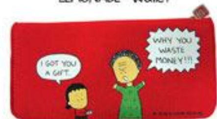
6200-WM "Waste Money" Wallet