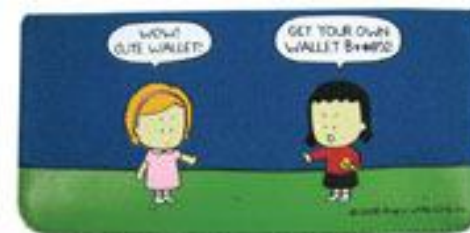
6200-BN "Get your own wallet b*#*@%!" (Censored)"