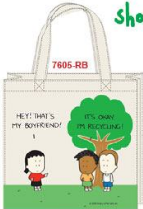
Recycle Boyfriend Tote