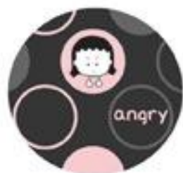
Angry Middle Fingers Pattern