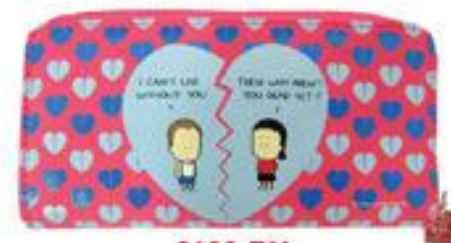
6100-DY "Dead Yet" Wallet