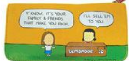
6200-LM "LEMONADE" Wallet