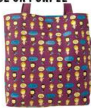
50407-PR "Bag B*!e%!" Tote

Pattern: "WOW! CUTE BAG!" "GET YOUR OWN BAG B*!e%!"