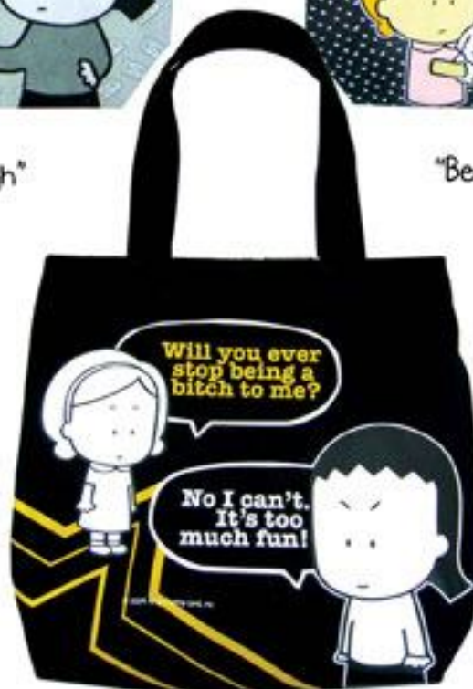
7701-TF "Too Much Fun"