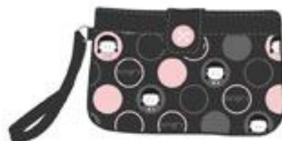
"Polkadot" Wristlet 7503-PK 9 L x 6 H