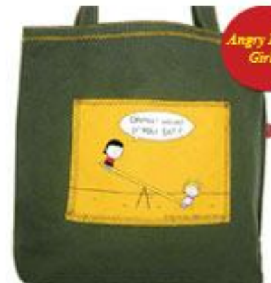
50407-DE "DAMN! WHAT D'YOU EAT?"