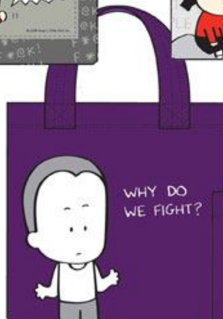
7604-FA - FRONT Fight for Amusement Tote