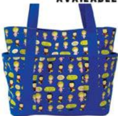
7100-PR "Bag B*!e%!" Garden Tote