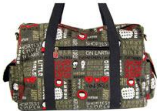
7305-AF Angry Fonts Overnighter