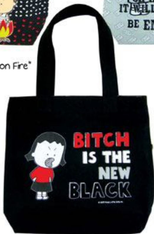
7701-NB "New Black"