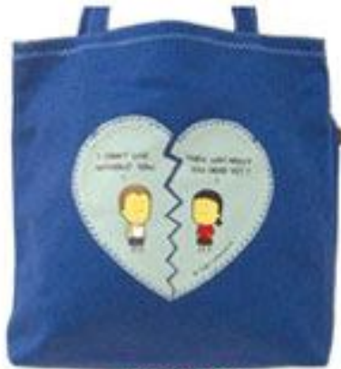
50407-DY "I CAN'T LIVE WITHOUT YOU" "THEN WHY AREN'T YOU DEAD YET?"