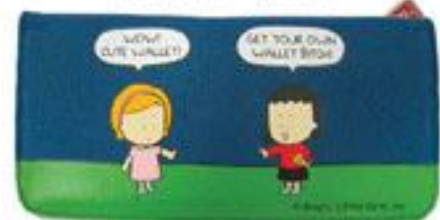
6200-BB "Get Your Own" Wallet