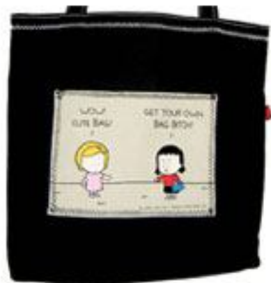
50407-BB "WOW! CUTE BAG!" "GET YOUR OWN BAG BITCH!"