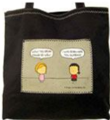
50407-SW "WOW! YOU SPEAK ENGLISH SO WELL!" "I WAS BORN HERE YOU DUMBASS!"