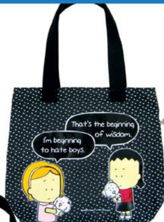
7701-BW "Beginning of Wisdom"