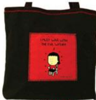
50407-EW "I MUST WAR WITH THE EVIL WITHIN!"