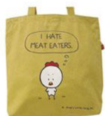
4118-ME "I HATE MEAT EATERS"