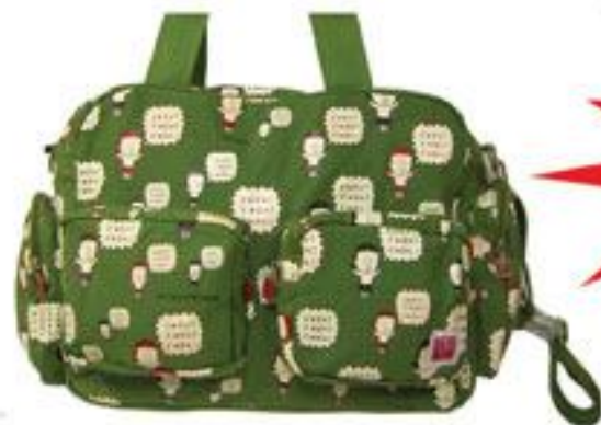
"F*ek!" Pattern Overnighter 5 3/4 L x 7 1/2 W x 11 1/2 H 6205-FP