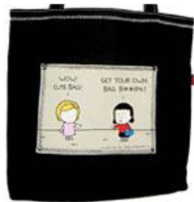
50407-BN (CENSORED) "WOW! CUTE BAG!" "GET YOUR OWN BAG B*ttch!"