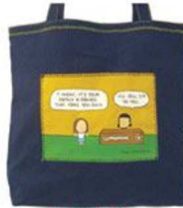
50407-LM "I KNOW IT'S YOUR FAMILY & FRIENDS THAT MAKE YOU RICH." "I'LL SELL 'EM TO YOU!"