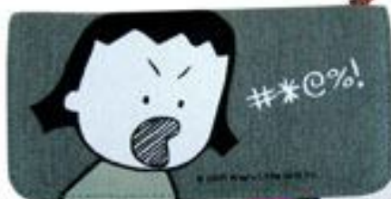
6200-EK CHARCOAL "Exploded Kim" Wallet