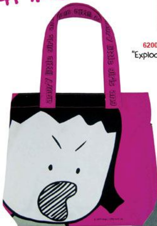
7703-EK "Exploded Kim" Tote