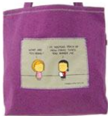
50407-AM "WHAT ARE YOU DOING?" "I'M KEEPING TRACK OF HOW MANY TIMES YOU ANNOY ME!"