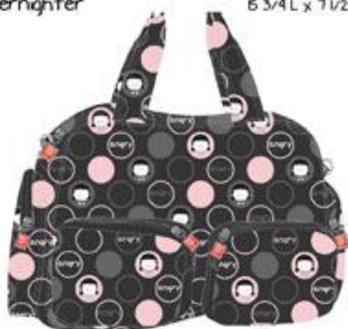
"Polkadot" Overnighter 7505-PK 5 3/4 L x 7 1/2 W x 11 1/2 H