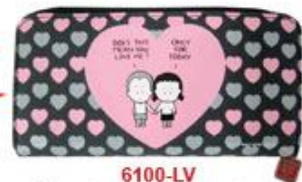
6100-LV "Only For Today" Wallet