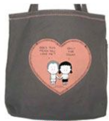
50407-LV "DOES THIS MEAN YOU LOVE ME?" "ONLY FOR TODAY."