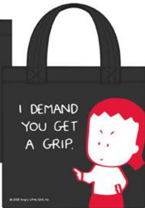
7604-DA - BACK