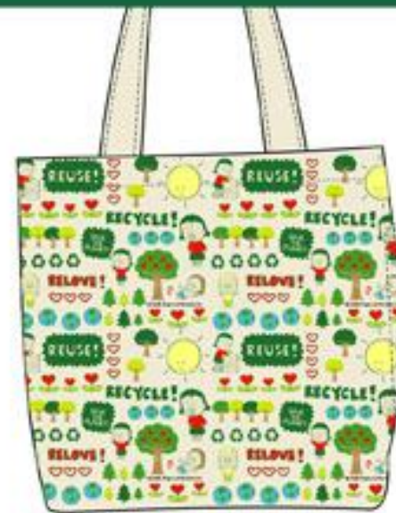
7607-RE "Recycle Pattern" Tote