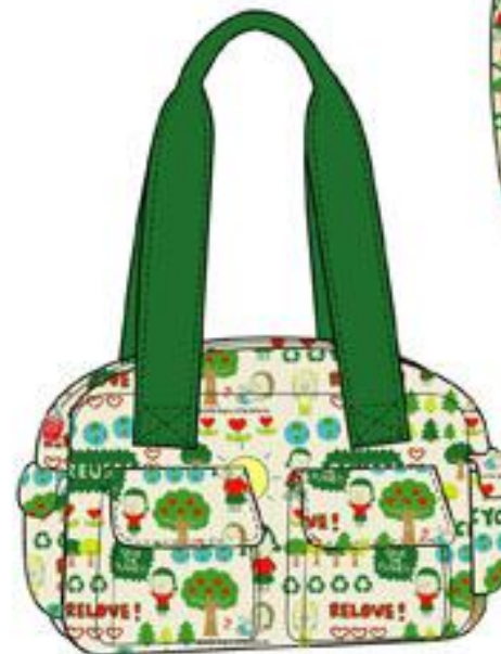
7608-RE "Recycle Pattern" 4-pocket Satchel 10.5 x 4.5 x 6.5