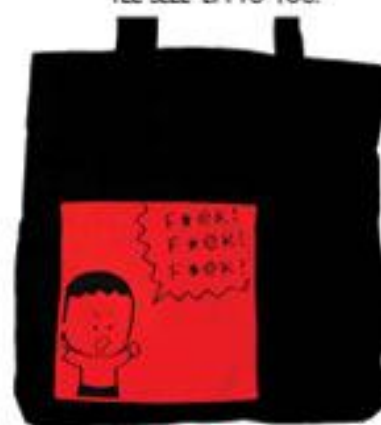
4118-FF "F*ck! F*ck! F*ck!"