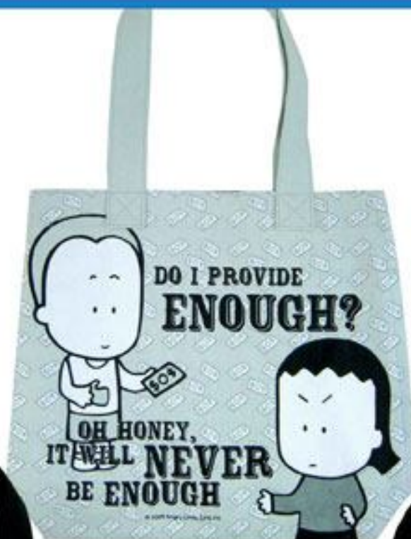
7701-NE "Never Enough"