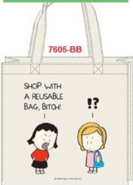
Reusable Bag Bitch! Tote