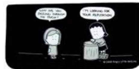
6200-RP "Reputation" Wallet