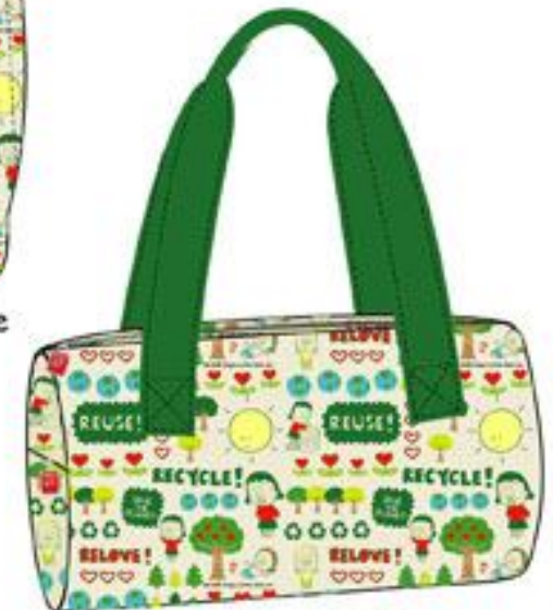
7609-RE "Recycle Pattern" 2-pocket Duffel B x 5.5 x 10.5