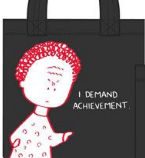
7604-DA - FRONT Demand Achievement Tote